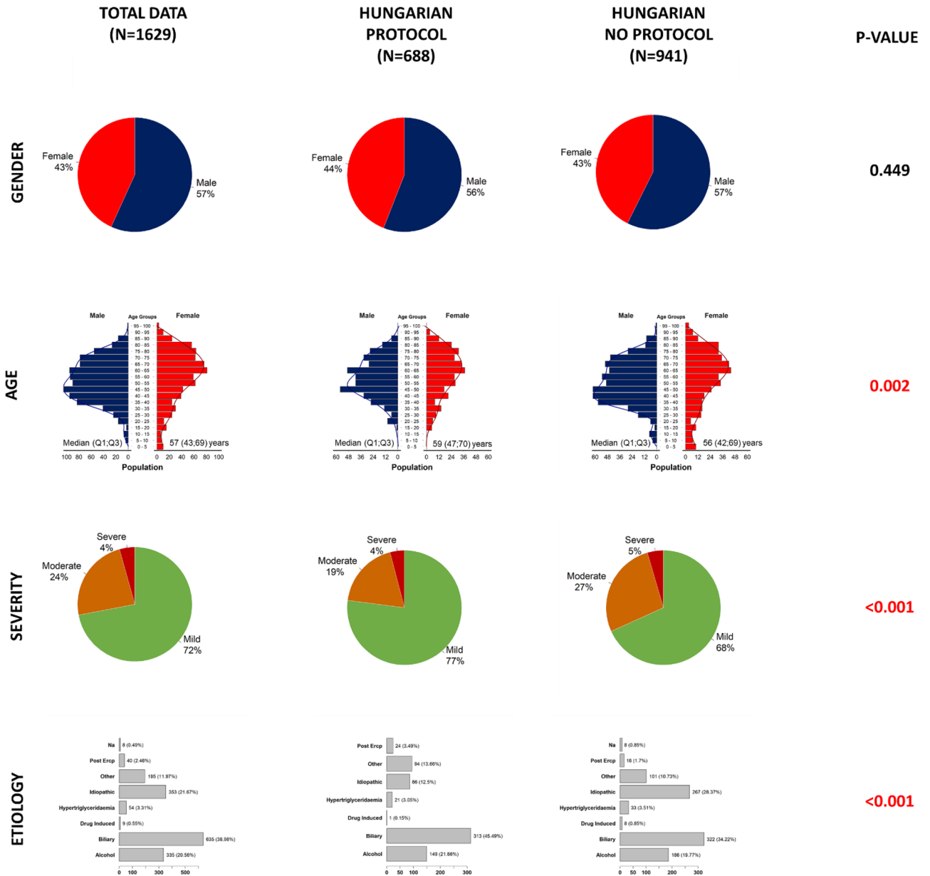
Figure 3. General characteristics of the Hungarian cohorts. Comparison of the protocol and non-protocol Hungarian cohorts. In terms of age, distribution of severity and etiology there is a significant difference among the subcohorts ( p < 0.05 ).