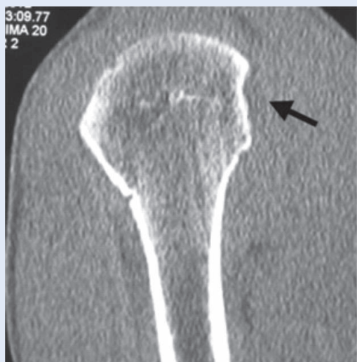
Figure 2. MRI showing the defect on the humeral head (Hill Sachs lesion)