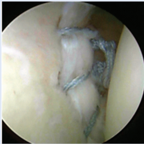
Figure 1. Arthroscopic image of the labrum repair

exam. The range of motion in the instable shoulder should be compared to the contralateral side. Instability tests will give us more information on the grade of instability. After clinical evaluation, a variety of imaging procedures can be used to determine the shoulder pathology. Among them, standard and special X-rays are basic. Sometimes we include ultrasonography or MRI to establish the soft tissue status. (Figures 2 and 3). The results of arthroscopic Bankart repair are generally very good 2,5,7 . The redislocation rate is reported to be between 6 % and 25 %, depending on the author's experience. A meta-analysis of comparing arthroscopic and open repair showed similar recurrence rates (6 % in arthroscopic and 6.7 % in open repair) 12 . In the second part of the study, after a longer follow-up, the reoperation rate was even bigger in the open group (9.2 %) than in the arthroscopic group (2.2 %). This report indicates that arthroscopic stabilization is a reliable method. Indications for arthroscopic Bankart repair are: 3-5 redislocations, well-defined anterior labrum and absence of bony defect on the humeral head or glenoid rim 13 .