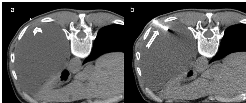
Fig. 1 Axial scan of a chest CT obtained during CT-guided transthoracic biopsy (histopathological diagnosis: epithelioid mesothelioma) 1a: radiopaque marker immediately next to a 5 mm thick solid pleural lesion (arrowhead) 1b: biopsy needle (arrow)