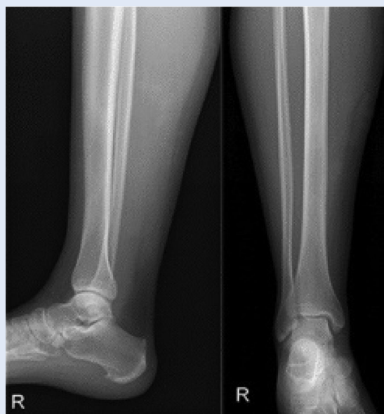
Figure 1. Plain x-rays of the right lower leg. No evident bone lesion is seen.