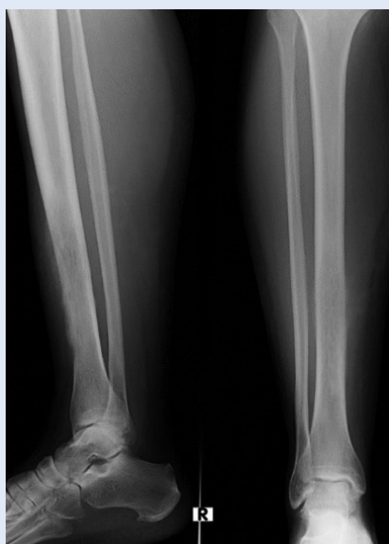
Figure 2. Follow up plain x-rays of the right lower leg. Intramedullary permeative bone lesion with cortical disruption of tibial diaphysis and surrounding soft tissue thickening.