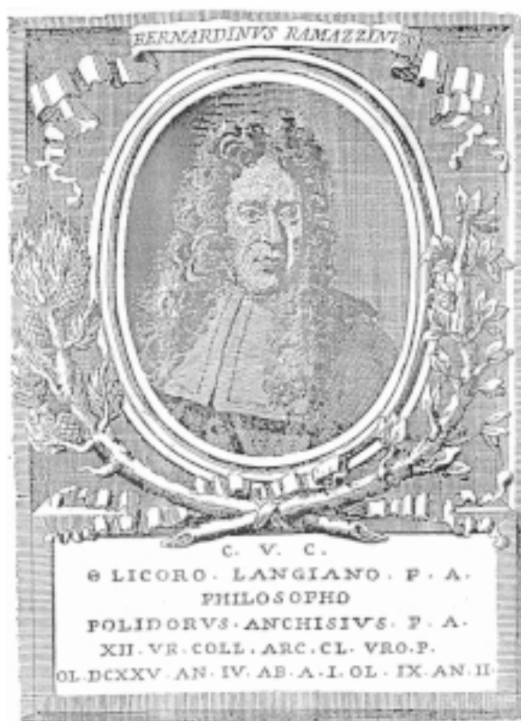
Figure 1 Bernardino Ramazzini (1633-1714), Italian physician, founder of occupational/industrial medicine

Bernardino Ramazzini (Figure 1) was born on 5 November 1633 in Carpi near Modena, Italy. He studied medicine in Parma and graduated in 1659. After that, he practiced in Roman hospitals for a while. He was offered the position of the leading physician in the little duchy of Castro, but he fell ill with malaria and withdrew to convalesce at his home in Carpi. As he got better, he accepted another offer, now from the neighbouring Modena, where he acquired the reputation of a competent practitioner and medical theorist. He was elected full professor ( professore primario ) of theoretical medicine at the local university in 1682 (at the age of 49 years). Eighteen years later, at the time of