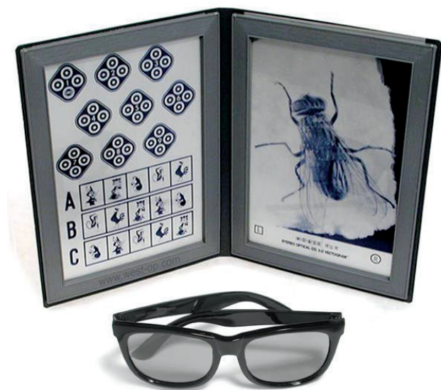
Picture 2. Titmus Wirt test

With great advances in cataract surgery, as well as intraocular lens design, and preoperative diagnostics much attention has been paid to improving postoperative optical quality. Due to those advancements postoperative anisometropia, astigmatism and aniseikonia are almost eliminated. To this day, the most frequently implanted intraocular lens (IOL) is a monofocal lens designed to provide excellent outcomes for distance, but usually, patients require refractive compensation for intermediate and near activities. In comparison to monofocal intraocular lenses, multifocal intraocular lenses (MIOLs) are designed to provide patients with an expanded range of vision and consequently reduce spectacle dependence after cataract surgery, also improving some quality of life aspects (25). The basic principle underlying the multifocal lenses is the simultaneous creation of more than one image point for a single object point. The corollary of this principle