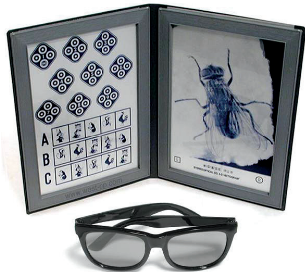
Picture 2. Titmus Wirt test

With great advances in cataract surgery, as well as intraocular lens design, and preoperative diagnostics much attention has been paid to improving postoperative optical quality. Due to those advancements postoperative anisometropia, astigmatism and aniseikonia are almost eliminated. To this day, the most frequently implanted intraocular lens (IOL) is a monofocal lens designed to provide excellent outcomes for distance, but usually, patients require refractive compensation for intermediate and near activities. In comparison to monofocal intraocular lenses, multifocal intraocular lenses (MIOLs) are designed to provide patients with an expanded range of vision and consequently reduce spectacle dependence after cataract surgery, also improving some quality of life aspects (25). The basic principle underlying the multifocal lenses is the simultaneous creation of more than one image point for a single object point. The corollary of this principle