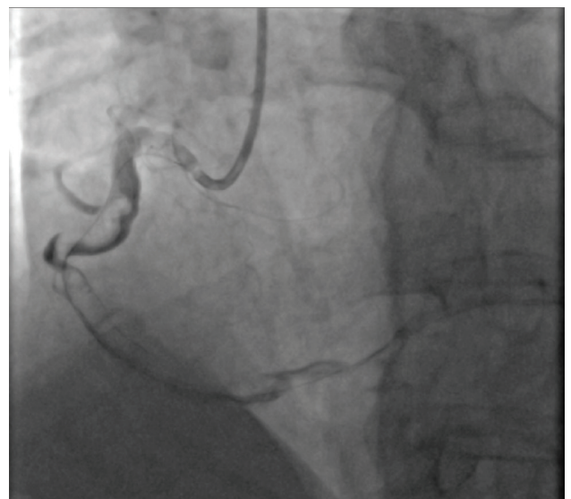
FIGURE 3. Right coronary artery after percutaneous coronary intervention.