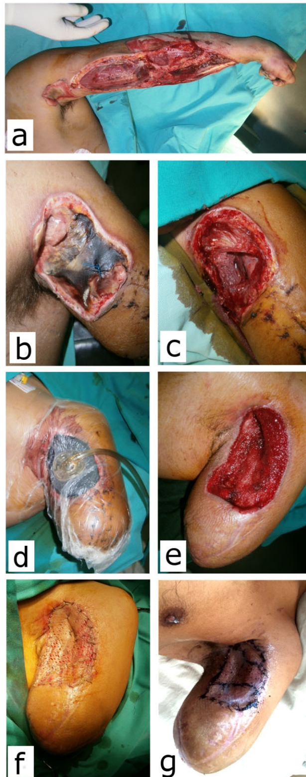
Figure 3. Arm amputation due to electrocution in a 16-year-old boy (Case 6). (a) Fasciotomy was performed immediately after injury; (b) Area of the coagulation necrosis on the base of the stump; (c) After debridement, 24 days post injury; (d) V.A.C. ® in place; (e) Granulation tissue after 3 weeks on V.A.C. ® ; (f) Wound covered with STSG; (g) Fourteen days after grafting, before referral to prosthetic treatment.