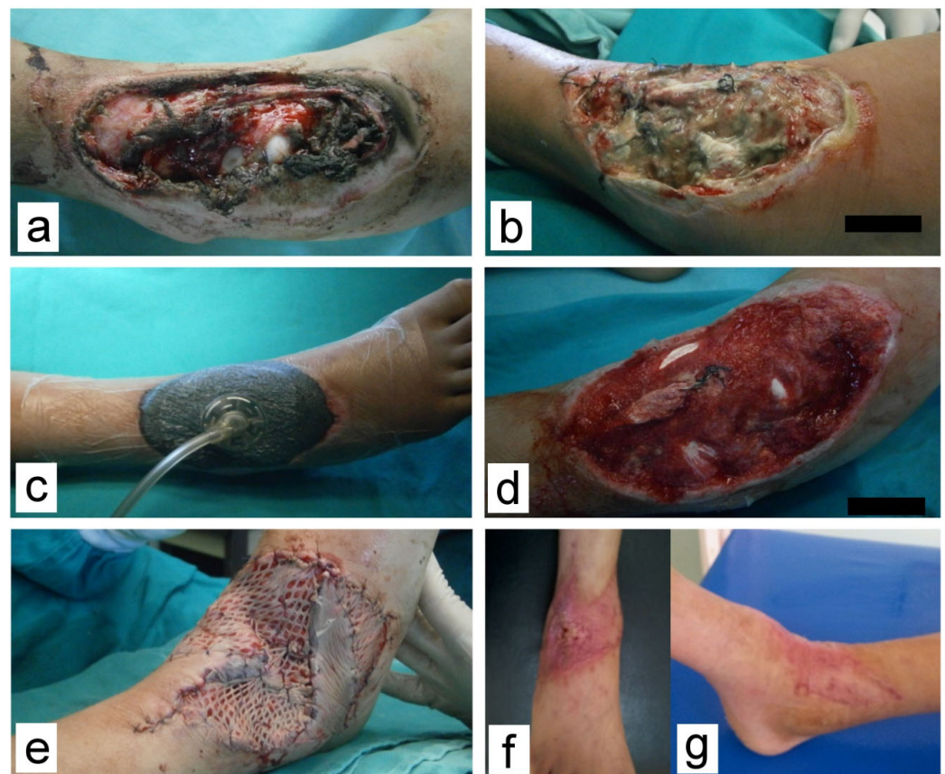
Figure 1. Complex wound with soft tissue defect in the region of the right talocrural joint. (a) At presentation; (b) Before debridement and V.A.C. ® , 4 days post injury; (c) After V.A.C. ® was applied; (d) Development of healthy granulations after 7 days of VAC treatment; (e) Wound was covered by STSG and local flaps after 13 days; (f,g) At the one-month follow-up.

Minor complications (8) were noted only in the NPWT group and were solely related to the V.A.C. ® therapy system. These minor complications were the obstruction of the drainage system (mainly Granufoam ® sponge, loss of vacuum, or drainage canister overflow). All these complications were addressed immediately, within an hour, as recommended. Modalities of definitive wound closure are presented in Table 4 and Figures 1–4.