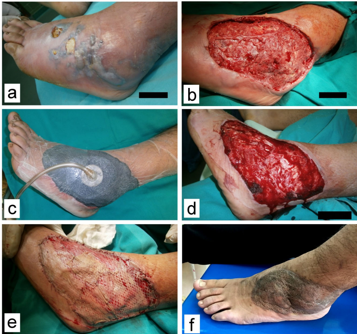
Figure 2. Wound on the right foot with necrotizing fasciitis caused by a streptococcus \beta -hemolyticus infection. (a) Prior to debridement; (b) Soft tissue defect after debridement 5 days post injury; (c) Marked decrease in soft tissue swelling during V.A.C. ® treatment; (d) Granulation tissue after 14 days on V.A.C. ® . Note adhered parts of black foam that had to be surgically removed; (e) Wound was covered with STSG after 20 days; (f) At the 2-month follow-up visit.