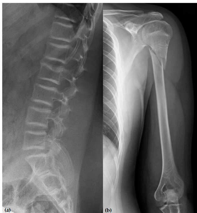
Figure 1. (a) Profile lumbar spine radiograph showing a compression fracture of the L2 vertebral body. The superior endplate is compressed posteriorly, with minor loss of vertebral body height corresponding to grade 1 by Genant classification. (b) Anteroposterior radiograph of the left upper arm showing a spiral fracture of the proximal third of the humerus.

The proband, a 15-year-old boy (164 cm, 65 kg, BMI = 24.2 kg/m 2 ), was the first child of a nonconsanguineous family. He was delivered vaginally at term with a birth weight of 3500 g. In the maternity ward, he had neonatal jaundice and phototherapy was performed. His psychomotor development was normal. He suffered his first low-trauma fracture (fifth metatarsal bone of his right foot) at the age of 2 years and ten months. Since then, he had experienced a total of 10 fractures, including a fracture of the neck of the left humerus, the radius metaphysis and a compression fracture of the L2 vertebra (Figure 1).