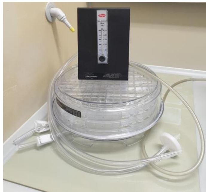
Figure 2. Hypoxia incubator chamber.

Variable durations of OGD can be used, depending on the purpose of the studies, and OGD could be applied intermittently or continuously. Regarding the duration of OGD, long-term protocols (from 40 min up to 72 h) are used to replicate hypoxia/ischemia-like conditions. In these protocols, ischemia/hypoxia can be followed by reperfusion, which has a significant impact on the outcomes of the experiment. This is perhaps most relevant and related to the effects of reperfusion on the changes in the intracellular \text{Ca}^{2+} levels [20]. Namely, it was found that during prolonged ischemia without reperfusion, there are two phases in the [\text{Ca}^{2+}]_i changes: hyperexcitation phase followed by the phase of global [\text{Ca}^{2+}]_i increase. If such a longer ischemic period is followed by reperfusion, this causes an additional sharp increase in [\text{Ca}^{2+}]_i and, subsequently, additional cell death. OGD can be used to study another experimental paradigm—the effects of and the possible neuroprotection provided by the hypoxic preconditioning. For example, these brief (3 to 10 min) hypoxic episodes have shown to alter glutamate receptor mediated [\text{Ca}^{2+}]_i response in hippocampal neurons [21].