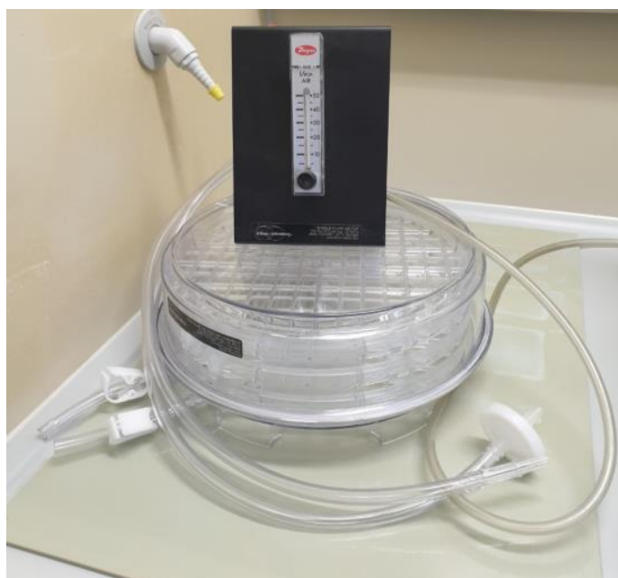
Figure 2. Hypoxia incubator chamber.

Variable durations of OGD can be used, depending on the purpose of the studies, and OGD could be applied intermittently or continuously. Regarding the duration of OGD, long-term protocols (from 40 min up to 72 h) are used to replicate hypoxia/ischemia-like conditions. In these protocols, ischemia/hypoxia can be followed by reperfusion, which has a significant impact on the outcomes of the experiment. This is perhaps most relevant and related to the effects of reperfusion on the changes in the intracellular \text{Ca}^{2+} levels [20]. Namely, it was found that during prolonged ischemia without reperfusion, there are two phases in the [\text{Ca}^{2+}]_i changes: hyperexcitation phase followed by the phase of global [\text{Ca}^{2+}]_i increase. If such a longer ischemic period is followed by reperfusion, this causes an additional sharp increase in [\text{Ca}^{2+}]_i and, subsequently, additional cell death. OGD can be used to study another experimental paradigm—the effects of and the possible neuroprotection provided by the hypoxic preconditioning. For example, these brief (3 to 10 min) hypoxic episodes have shown to alter glutamate receptor mediated [\text{Ca}^{2+}]_i response in hippocampal neurons [21].