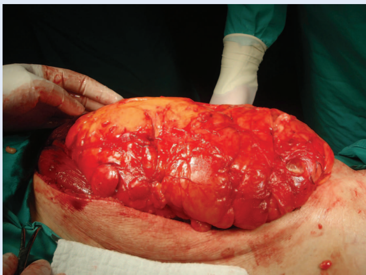
Figure 1. Huge lipoma of the thigh. Intraoperative photography.

firmed a mesenchymal tumour with atypical cells. Surgery was performed next in which the tumour was extirpated from the adductor canal (Figure 1). During the operation it was confirmed that by its size and mass, the tumour compromised adjacent blood vessels. The dimensions of the tumour, according to pathological findings, were 27×20×9 cm (Figure 2). The pathohistological diagnosis confirmed an intramuscular lipoma with atypical cells.