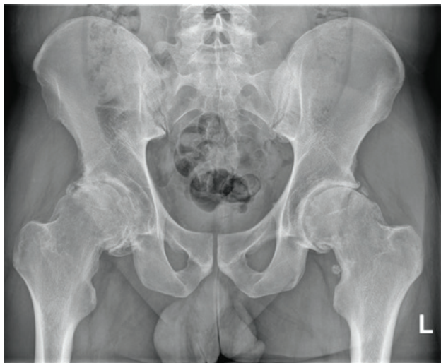
Figure1. Anteroposterior X-ray image of the patient's hips showing severe bilateral coxarthrosis.