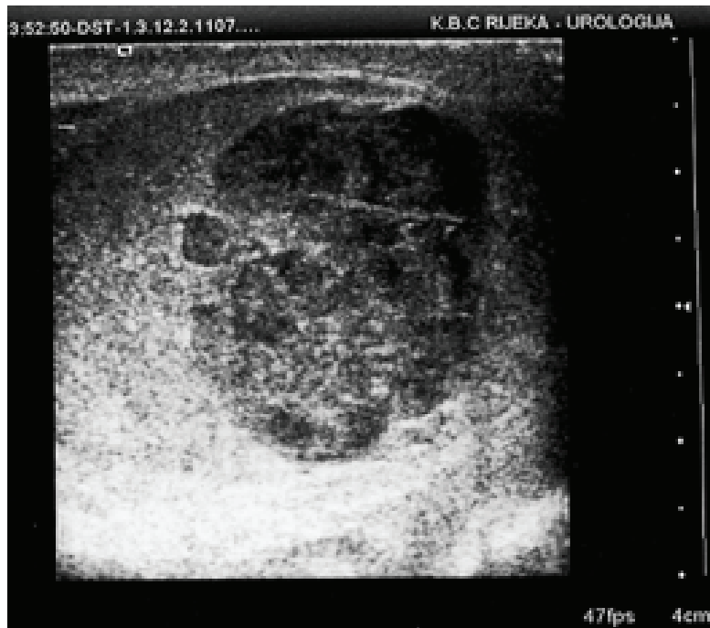
Figure 1 Ultrasound: hypoechogenic focal lesion in the lower pole of right testicle.

Because ultrasound findings of the right testicle were highly indicative of testicular neoplasm, right radical orchiectomy was performed via an inguinal incision.