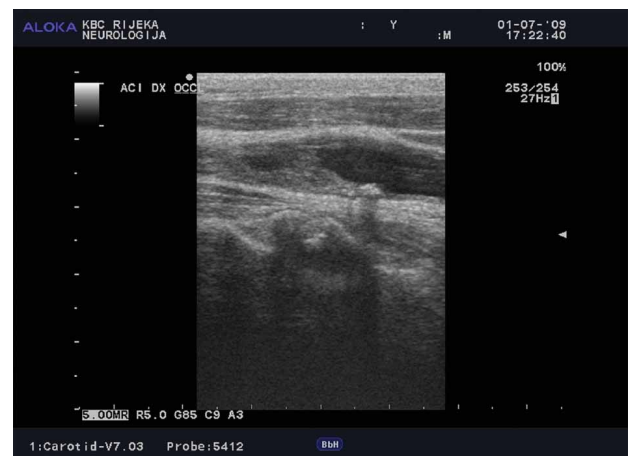
Fig. 2. Radiation-induced occlusion of internal carotid artery.