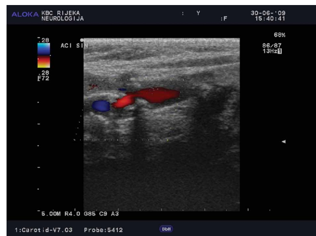
Fig. 3. Radiation-induced carotid stenosis.

The average age of patients in the study group with radiation-induced CAS was 53.6 years, and that of the control group without CAS 66.8 years. The median follow up since RXT was 5.2 years. Duplex ultrasound scans revealed that 14 (33.33%) of patients had significant radiation-induced CAS. Five patients (11.9%) had unilateral carotid occlusion (Figure 2) and four patients (9.52%) have had stroke after radiation therapy. The majority (over 85.71%) of radiation-induced CAS had more than one atherosclerotic plaque including any degree of stenosis in the RT group, and had significantly more than that of the control group (Figure 3). Male patients are significantly more prevalent in CAS group than female ( p >