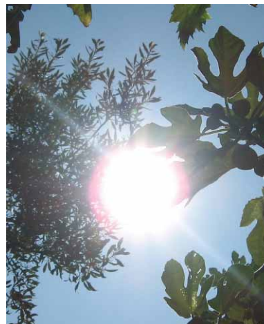
Fig. 3. a) Photography of »Solar Halo« 10 minutes before the sunset b) sunrise at 6.30 a.m. with an indigo-blue solar-halo c) sun radiation in 2.30 p.m. with high intensity solar radiation – »solar halo«.