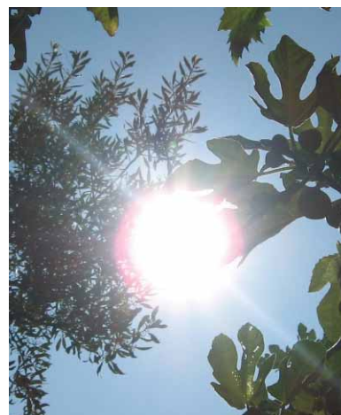
Fig. 3. a) Photography of »Solar Halo« 10 minutes before the sunset b) sunrise at 6.30 a.m. with an indigo-blue solar-halo c) sun radiation in 2.30 p.m. with high intensity solar radiation – »solar halo«.