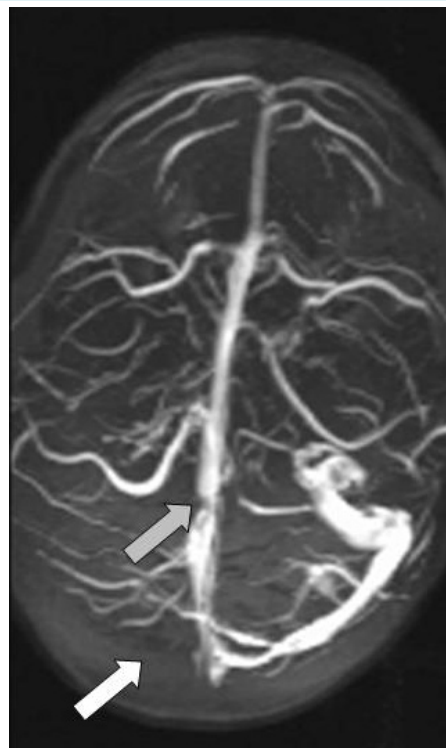
FIGURE 2. Brain magnetic resonance venography (MRV) showing no flow in the right transverse sinus and ipsilateral cortical veins (white arrow) and partially occluded flow in the superior sagittal sinus (gray arrow).

This case report presents difficulties in diagnosing the cause of postpartum headache in a patient who under-