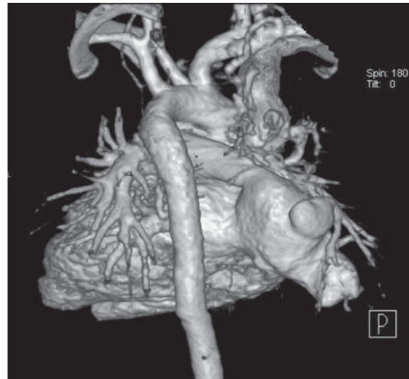
Figure 2. Multi-slice computed tomography (MSCT) pulmonary angiogram confirmed the aneurysm of the left atrium (ALA), 7.6 cm in largest diameter which was in wide communication with right pulmonary artery (RPA).

revealed a posterior oval sac-like dilatation or aneurysm of the heart.