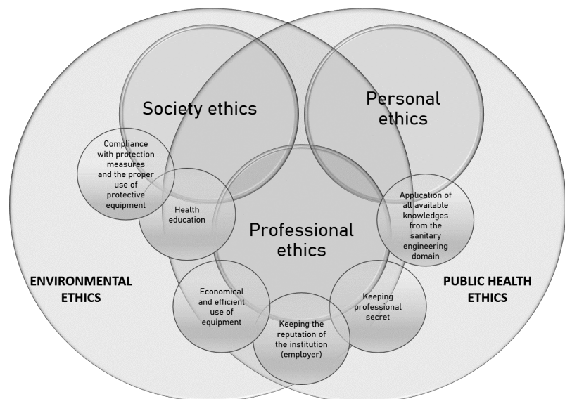
Fig. 1. Ethical aspects of sanitary engineering, based on a description of the profession (our work, based on text from Narodne novine 2009)

We can conclude with a brief summary of the possible framework for sound professional ethics of sanitary engineering. From the curricula, it appears that professional duties are fairly clear, but a future code of professional ethics should clearly include the following: (1) moral norms or duties to the community