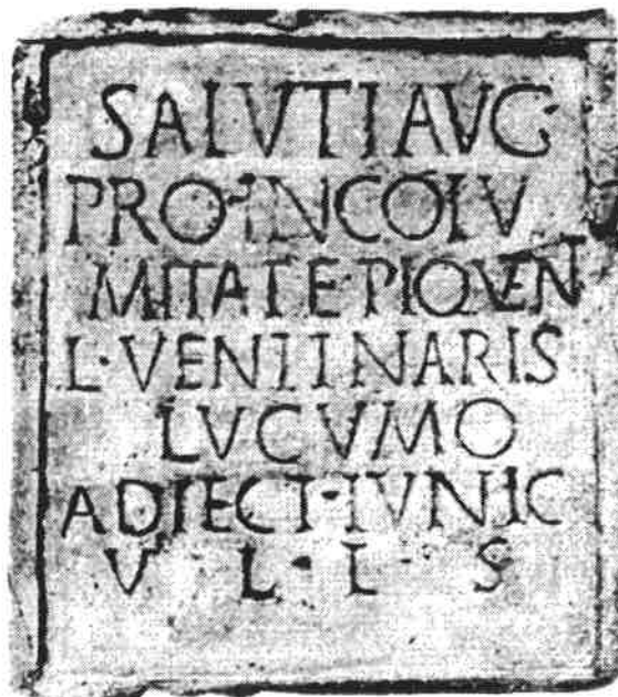
Figure 1 Plate expressing gratefulness to the Goddess of Health, Augusta, erected by the priest Lucius Ventinarius Lucumo at the end of the third century A.D. Goričica near Buzet

antibiotics were discovered the plague definitely lost the battle with human mind. Nonetheless, the story about plague does not end here. After decades of long abstinence, hidden in the world of oblivion, child-scaring and ignorance, lung plague flamed up in September 1994 in Surat (India) with the spreading tendency (Delhi, Calcutta), despite the anti-epidemic measures which had been adopted by the larger part of the world.