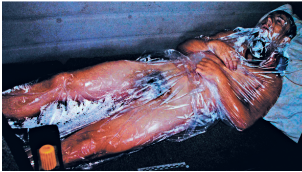
Fig. 1. The decedent was discovered in his cabin enveloped in plastic bag with a tank of propane gas placed underneath.