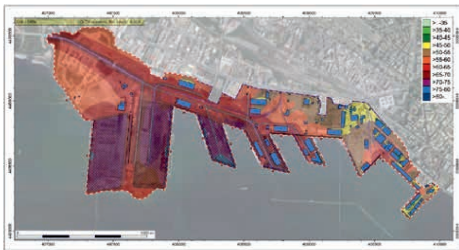
Figure 2: Noise map from the Thessaloniki Port Authority yearly report [45]