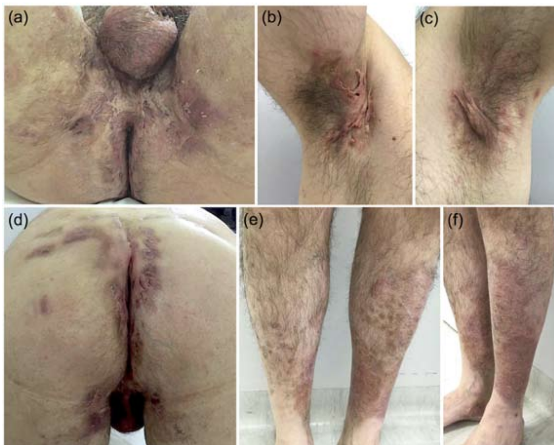
Figure 2. Clinical presentation at 6 months from the beginning of treatment with adalimumab. (a-d) scarring and minimal residual erythema in HS sites and (e, f) complete resolution of PG on the lower legs, with residual postinflammatory dyspigmentation and fine scaling.

Infliximab was used in 8 and adalimumab in 7 cases, including our patient, with comparable success rate. Both drugs showed encouraging results, with adalimumab displaying a slightly more consistent effect regarding remission of HS lesions (Table 1). In our patient, we chose a fully humanized anti-TNF agent due to the lower potential for the development of anti-drug antibodies that could ultimately lead to loss of efficacy, less common adverse effects such as antibody-mediated infusion reactions and the convenience of self-administered SC injections. While implementing the HS treatment scheme provided by Miller et al. , our patient did not show the satisfactory control of inflammation in HS lesions by week 12 as was expected (5). However, similarly to the results published by Kimball et al. (21), a significant improvement was reached after an additional 4 weeks of treatment, indicating that the treatment should be continued past week 12.