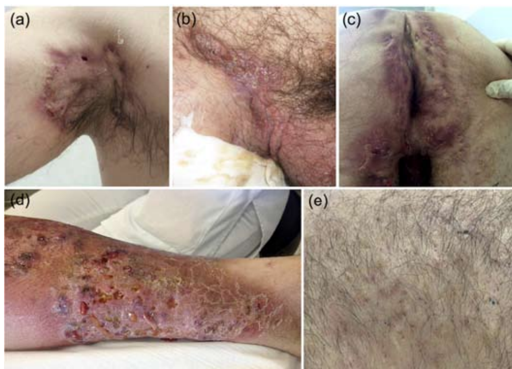
Figure 1. Clinical presentation at baseline. Active HS lesions in (a) the right axilla, (b) the right inguinal, (c) perineal and gluteal regions, (d) PG lesions on the left lower leg comprised of multiple pustules and punched out ulcers and (e) open comedones and depressed scars as sequelae from severe pubertal acne.

arthritis, PG, acne), PAPASH (pyogenic arthritis, PG, acne, HS), PsAPASH (psoriatic arthritis, PG, acne, HS) and PASS (PG, acne, HS and seronegative spondyloarthritis), PASH sets itself apart by showing strong affinity towards the skin, while lacking the presence of arthritis, one of the hallmark features of all aforementioned entities (1,8). While mutations in the gene encoding the proline-serine-threonine-phosphatase-interacting protein 1 (PSTPIP1) have been found specifically in PAPA and PAPASH patients, PASH patients can have a wide array of genetic alterations typically occurring in different autoinflammatory diseases (1,8,9). Suggested pathophysiology common to this whole group of diseases includes hyperactivated innate inflammatory response with increased interleukin-1 beta and TNF-alpha signaling, as well as consequent recruitment and activation of neutrophils (9,10).