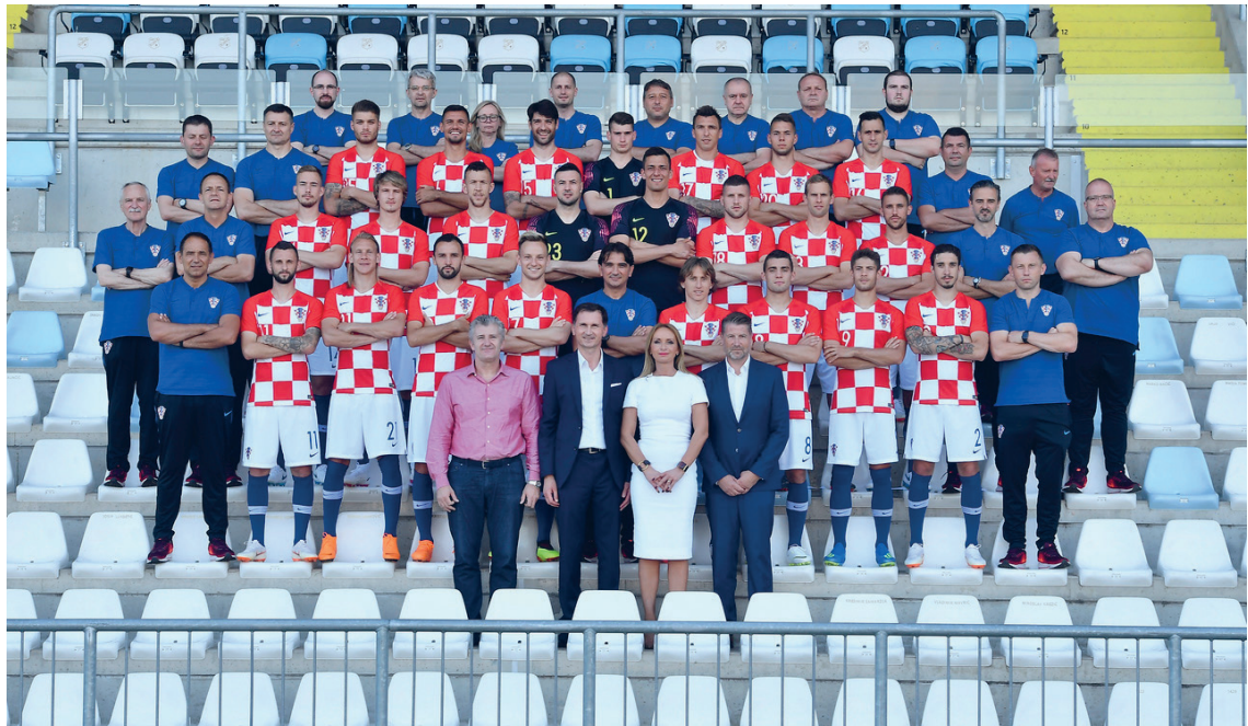
Photo: Croatian National Football Team before the 2018 FIFA World Cup with the management of its official health care organization, St. Catherine Hospital.