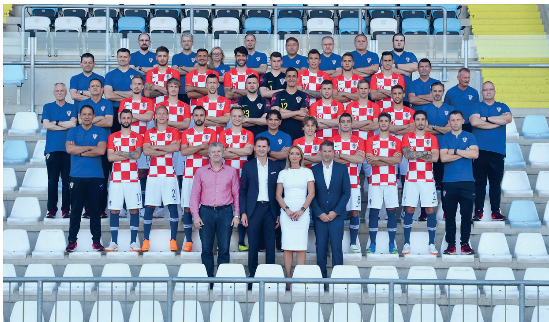
Photo: Croatian National Football Team before the 2018 FIFA World Cup with the management of its official health care organization, St. Catherine Hospital.