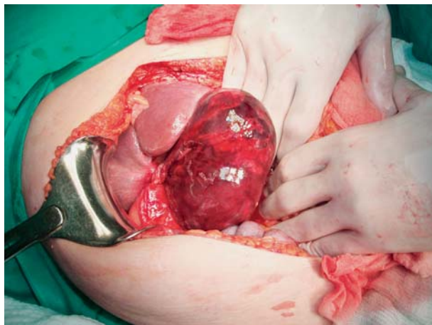
Fig. 1. The gallbladder was gangrenous and greatly distended, with 360° clockwise torsion around its mesentery.

blood analysis, abdominal ultrasound and plain abdominal x-ray.