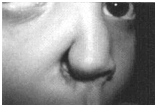
Fig. 1. Defect of the nasal wing in a five-year-old girl with megakaryoblastic leukemia after suffering from nasal mucormycosis.