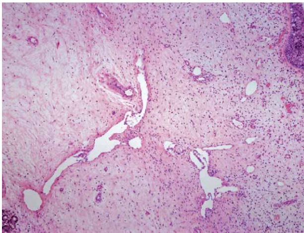
Fig 2a. The polypoid inflamed mucosa overlaying the neoplastic tissue, with peculiar large vessels giving the impression of highly vascularized nasal polyp.