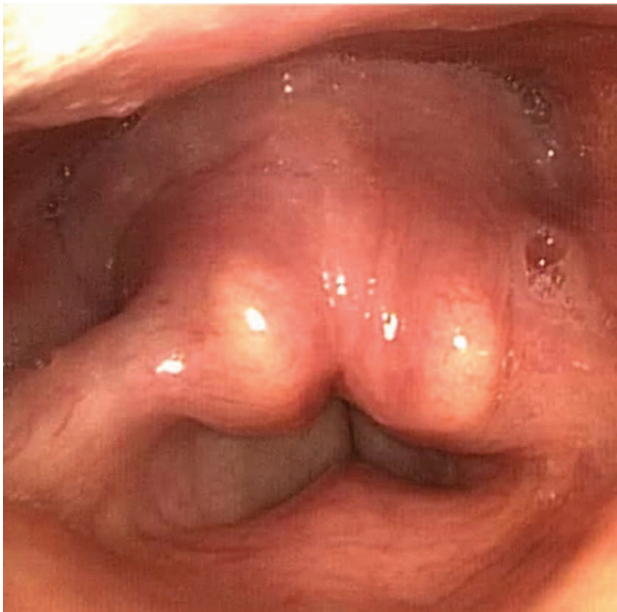
Figure 3. Control flexible nasolaryngoscopy found no fluid retention in the right piriform sinus or tracheal aspiration and satisfactory compensatory movement of the left side with good glottic closure during phonation.

to rotate the head or weakness in shrugging the shoulders. [8,9,10,11] Obstruction of the traversing venous sinuses and veins can also occur, resulting in headache and papilledema due to intracranial venous congestion leading to cerebral edema and raised intracranial pressure. [1]