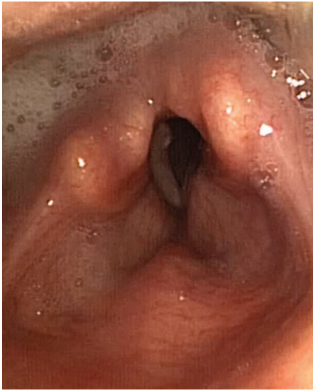
Figure 1. Flexible nasolaryngoscopy showing right vocal fold palsy during phonation, saliva stagnation in the retrocricoid region and right piriform sinus.

symptomatic therapy (soft collar, nasogastric tube, anti-edematous therapy, etc), she underwent multidisciplinary diagnostic procedures. The evaluation established impaired right palatopharyngeal reflexes, denivelation of the right palatopharyngeal arch with uvular deviation, and limited elevation of the right shoulder. Flexible nasolaryngoscopy and fiberoptic endoscopic evaluation of swallowing displayed abduction and immobility of the right vocal fold, and fluid retention in the right piriform sinus along with tracheal aspiration.