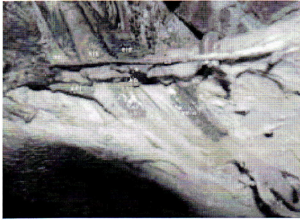
Fig. 1. Photography of the right side of the specimen show the femoral triangle with the origin of the obturator artery and termination of the obturator vein.

only one obturator vein and it is parallel to the OA and in front of the OA. The obturator vein ends into the femoral vein from the front, at 1.5 cm lower level than is the origin of the OA. The calibre of the OA and OV is 3.5 mm. During the dissection of the blood vessels of the left part of the pelvis we found the regular anatomical pattern.