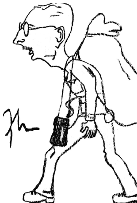
Figure 1. Zvonimir Maretić’s caricature of himself as a scientist and adventurer

Latrodectus comes from the Greek “lathrodektes” meaning “secret biter”, while tredecimguttatus comes from Latin and means “13 drops”, which is associated with red spots on the black widow’s abdomen. 17 The word latrodectism is a compound of an uncertain etymology: the first part of the compound may be from Latin ( latro, latronis ), meaning a robber or thief, or from Greek ( latra ) standing for secretly and stealthy. The extension of the second part of the Greek verb ( daknein ) explains the nature of biting. Maretić characterised latrodectism as an occupational disease in Croatia, particularly in rural areas where the population is engaged in agricultural activities, especially harvesting. The black widow’s natural habitat is precisely the dry area, the rocks and the underwood, so the spider usually hides in corn and dry bundles of twigs and crops (figure 2). Most of Maretić’s patients were stung in the areas of the thighs and forearms. 18 Maretić’s initial research was