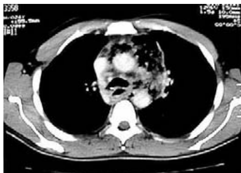
Figure 2. CT of the mediastinum: mediastinal purulence and clear lungs.

the patient was cardiocirculatory instable, with abnormal coagulogram, haematogram and hepatogram. Daily follow-up chest X-rays were performed, and on the 7th day after thoracotomy the follow-up chest X-ray showed lower transparency of lung lobes, indicating a follow-up thoracic CT was required. The CT scan demonstrated enormous bilateral pleural empyemas, with a marked reduction in respiratory space and a paracardial purulence (Figure 3).