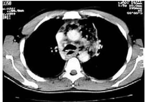
Figure 2. CT of the mediastinum: mediastinal purulence and clear lungs.

the patient was cardiocirculatory instable, with abnormal coagulogram, haematogram and hepatogram. Daily follow-up chest X-rays were performed, and on the 7th day after thoracotomy the follow-up chest X-ray showed lower transparency of lung lobes, indicating a follow-up thoracic CT was required. The CT scan demonstrated enormous bilateral pleural empyemas, with a marked reduction in respiratory space and a paracardial purulence (Figure 3).