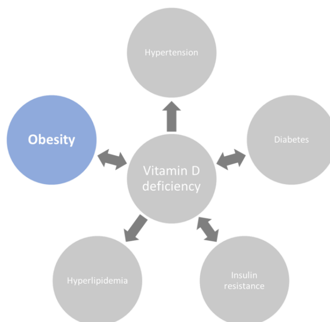
Figure 1. Vitamin D deficiency is strongly related to obesity as well as to other components of adiposity-related dysmetabolic state.

Low VD is also associated with poor health behaviors. Recently, its deficiency has been associated with a large number of disorders such as metabolic syndrome, cancers, and autoimmune, psychiatric, and neurodegenerative diseases, but the causative role of VD deficiency in many of these conditions remains unclear [7]. Since VD deficiency is related to visceral adiposity; it could be used as a biomarker of a visceral adiposity-related dysmetabolic state (cardiovascular diseases, type 2 diabetes, dyslipidemia, arterial hypertension) (Figure 1). Nevertheless, its independent role in the development and progression of these diseases cannot yet be excluded, due to changes in the expression of genes regulated with VD receptors. Moreover, as stated below, in VD deficient subjects, the lack of possible anti-inflammatory effects on chronic low-grade inflammation could lead to an enhanced risk of obesity-related metabolic disorders.