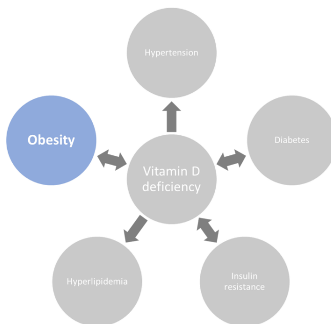
Figure 1. Vitamin D deficiency is strongly related to obesity as well as to other components of adiposity-related dysmetabolic state.

Low VD is also associated with poor health behaviors. Recently, its deficiency has been associated with a large number of disorders such as metabolic syndrome, cancers, and autoimmune, psychiatric, and neurodegenerative diseases, but the causative role of VD deficiency in many of these conditions remains unclear [7]. Since VD deficiency is related to visceral adiposity; it could be used as a biomarker of a visceral adiposity-related dysmetabolic state (cardiovascular diseases, type 2 diabetes, dyslipidemia, arterial hypertension) (Figure 1). Nevertheless, its independent role in the development and progression of these diseases cannot yet be excluded, due to changes in the expression of genes regulated with VD receptors. Moreover, as stated below, in VD deficient subjects, the lack of possible anti-inflammatory effects on chronic low-grade inflammation could lead to an enhanced risk of obesity-related metabolic disorders.