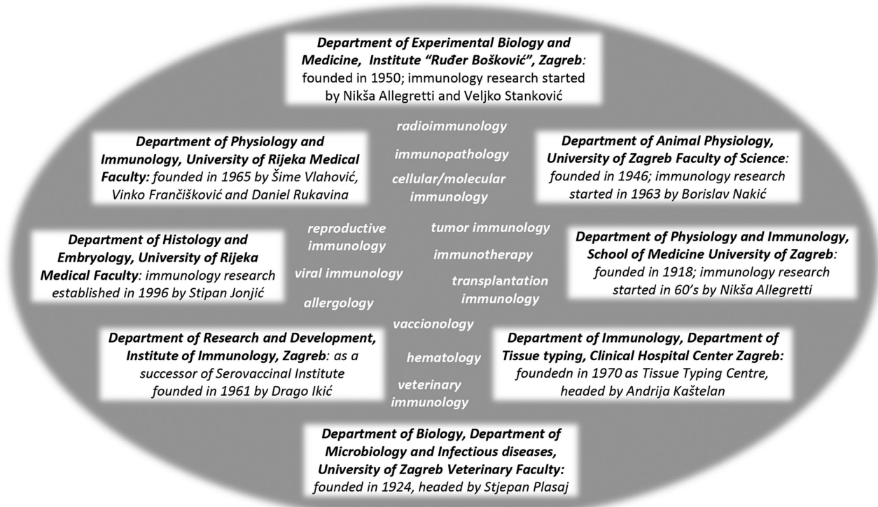
Figure 1. Institutions that fostered the development of immunology in Croatia, with major immunology branches started by founding research groups.

infectious diseases [1]. Since then, Croatia has kept in case with immunological developments within the rest of the world, implementing new serotherapeutic and immune-prophylactic regimens as they became available. Well before the middle of the 20 th century, extensive programs had been initiated for the prevention of variola, and vaccination against and treatment of infectious agents such as diphtheria, typhus, paratyphus, rabies and cholera, which dramatically reduced the prevalence of these infectious diseases in our region [2]. Around the 50's and 60's,