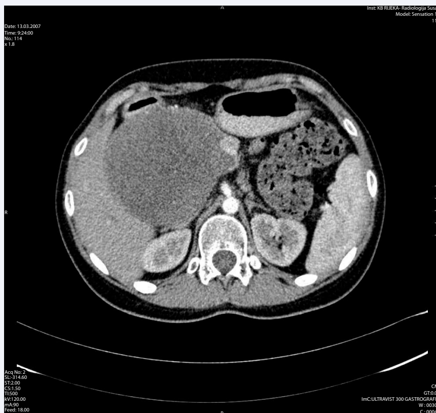
Figure 2 Abdominal computed tomography suggestive of liver lesion.