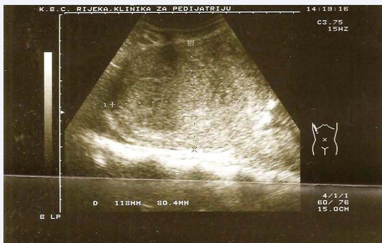
Figure 1 Abdominal ultrasound suggestive of heterogeneous liver lesion, measuring 12x8 cm.

The girl is regularly followed-up clinically and with imaging studies. Seven years after the diagnosis she is in complete