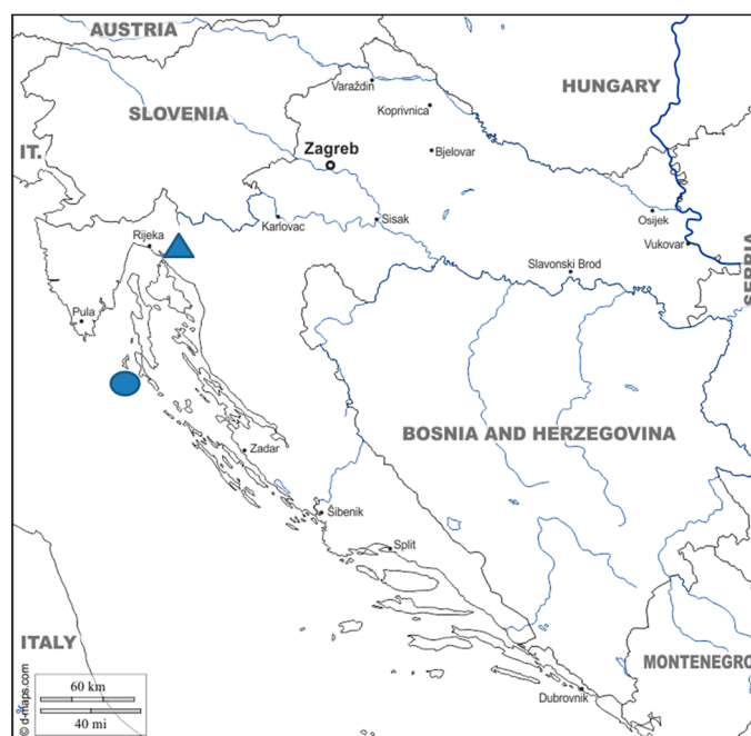
Figure 1. Location of the two studied populations (▲ = town of Bakar; ● = town of Mali Lošinj). Background map source: https://d-maps.com/carte.php?num_car=14898&lang=en .

The centre of the administrative unit of the town of Bakar is the settlement of the same name—Bakar, located on the north-eastern edge of the Bay of Bakar, 7.6 km airway distance to the south-east of the city of Rijeka—the macro-regional centre and the centre of the Primorje-Gorski Kotar County. In the first decades following the Second World War, in the wider area of the Rijeka Ring—the area surrounding the city of Rijeka, a process of intensive industrialisation took place. In the Bay of Bakar several power and industrial plants were built. Thus in 1965 the Urinj oil refinery started operating followed by the thermal power plant Urinj and the coking plant Bakar in 1978 [3]. Depending on the leading economic sector, the structure of the employed population in the area of the town of Bakar lived to see several changes in the period 1960–2012. According to the 1961 census, the majority of the employed persons with a residence in the town of Bakar were employed in the tertiary sector notably in the traffic and trade industries while according to the 1971 and 1991 census the primacy is taken over by the secondary sector (industry) following which the tertiary sector again takes the first place [4–8].