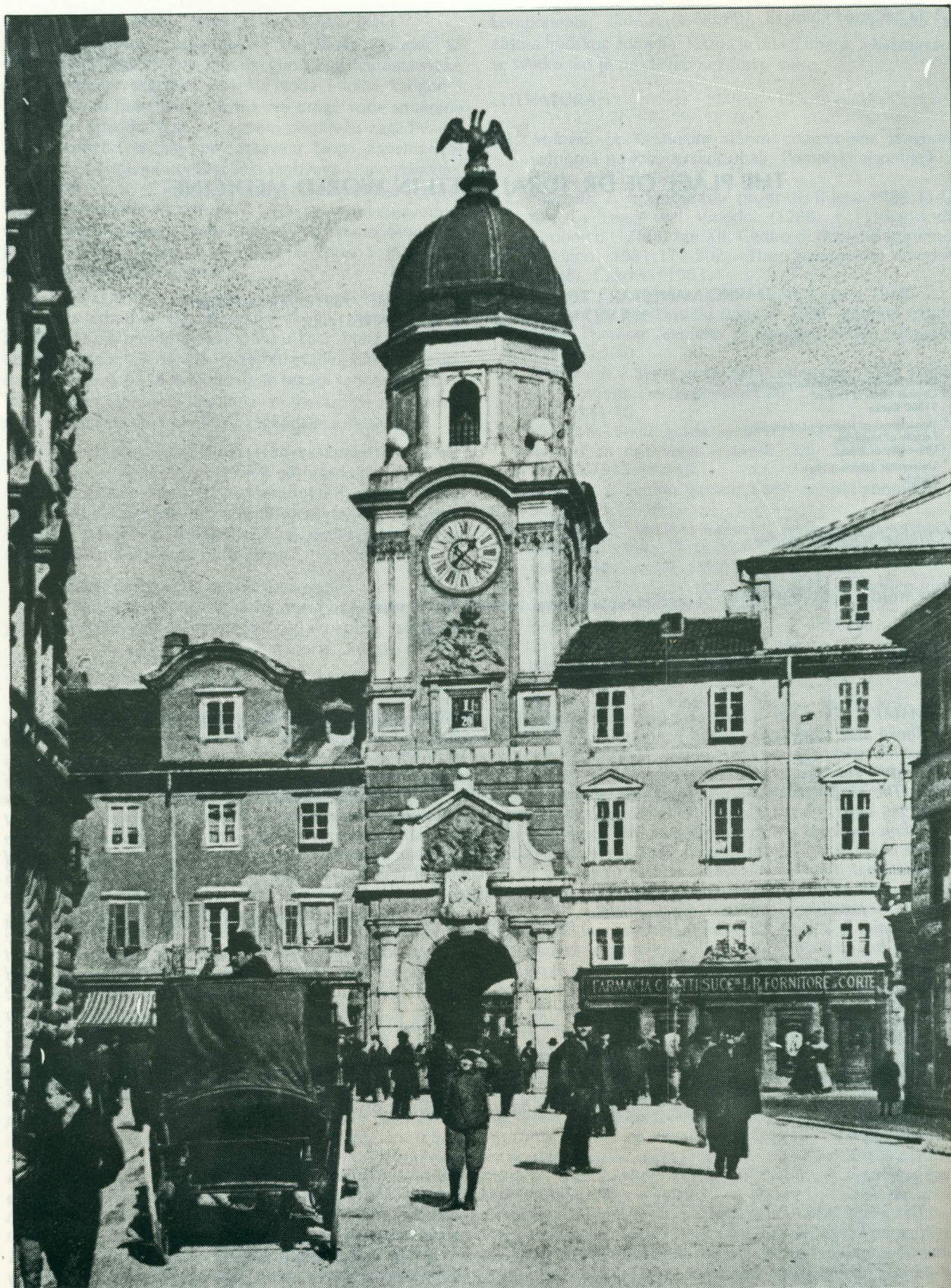
Figure 1 Municipal tower in the city of Rijeka. On the right side is chemist's Catti. Slika 1 Gradski toranj u Rijeci. Desno ljekarna obitelji Catti.