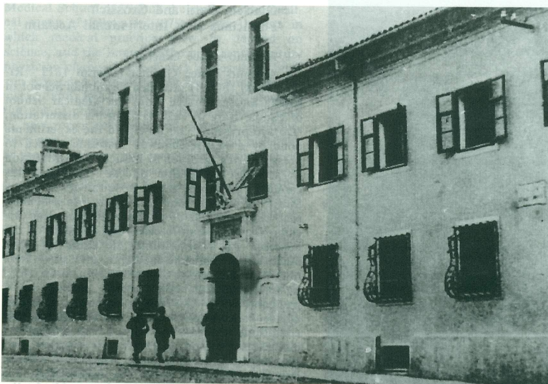
Figure 2. Hospital of the „Holy Spirit“ in the end of 19th century.