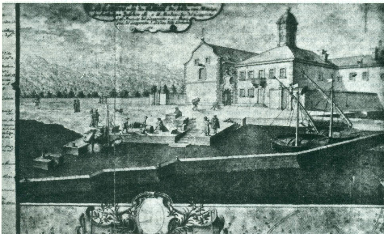
Figure 1. The old lazaret in the harbor of Mandrač (Graphic in Historical and Maritime Museum of Rijeka).