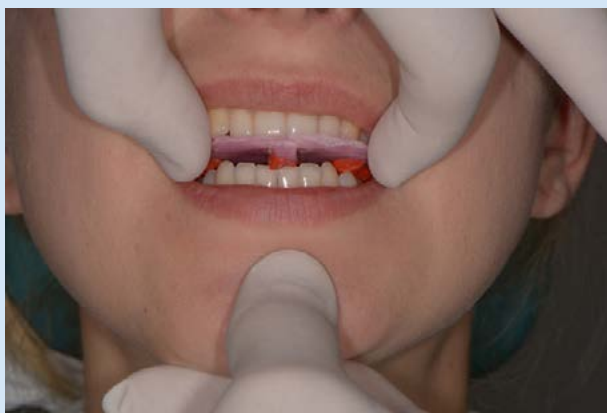
Slika 1. Određivanje položaja centrične relacije pomoću akrilatnog nosača s prednjim deprogramatorom i metode vođenja brade.

Figure 1 Registration of the centric relation position using a bite plate with a jig and a chin point guidance method.