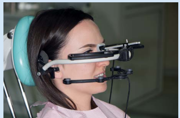
Slika 2. Ultrazvučni uređaj za snimanje kretanja donje čeljusti na temelju šest stupnjeva slobode

Figure 1 Registration of the centric relation position using a bite plate with a jig and a chin point guidance method.