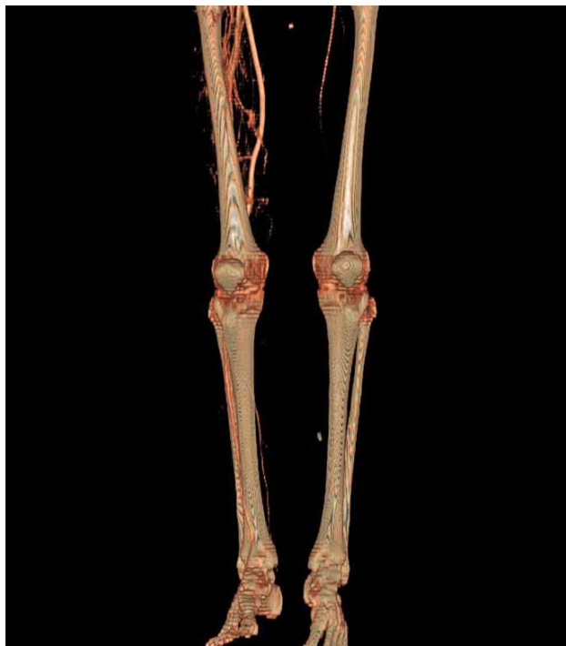
Fig. 4. Loss of blood flow distally of left popliteal artery.

Also, signs of starting thrombosis of false lumen in aortic arch and left external iliac artery were noted. Pre occlusive stenosis of the left common and external iliac artery.