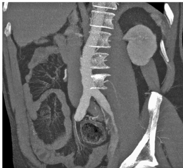
Fig. 3a and 3b. MSCT angiography.

After MSCT angiography patient was immediately transferred to the operating theatre.