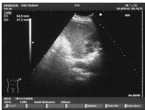
Fig. 1. Abdominal ultrasound image showing enlarged spleen (125×45 mm) with hypoechoic area measuring 54×41 mm on convex side of upper pole, and free liquid in left subphrenium.

Abdominal pain is uncommon sign in infectious mononucleosis syndrome and if occurs in the course of disease, splenic hematoma and/or rupture must be considered. Vice versa when a patient is admitted to a hospital because of upper abdominal pain and diagnosis of splenic hematoma is made, mononucleosis syndrome should be included among possible causes. In such circumstances of otherwise asymptomatic patient, as illustrated in our case, routine laboratory tests can be of a great value.