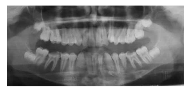
Fig. 1. Panoramic radiograph showing a horizontally laid lower left second incisor surrounded by a radiolucent zone at the level of apices of the left lower canine, first and second premolar.