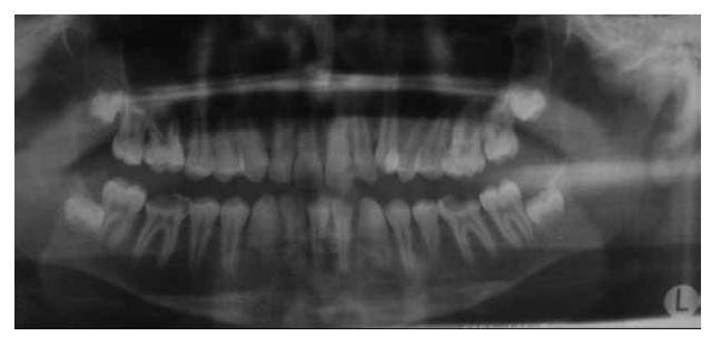
Fig. 3. Panoramic radiograph 1 month postoperatively showing a new layer of bone formed within the defect, previously occupied by the displaced incisor.

dpiece and a round bur and the tooth was removed together with the surrounding soft tissue. The surface of the crown and root of the removed incisor showed resorption due to the repetitive inflammation episodes (Figure 2). The flap was replaced and secured with 3–0 resor-