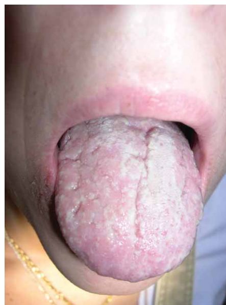
Fig. 4. Oral findings in patient with pyostomatitis vegetans and ulcerative colitis – pustules and fissures on the the dorsal side of tongue.

Pyostomatitis vegetans (PV) is a rare chronic mucocutaneous disorder 1-3 . PV was first reported by Hallo-