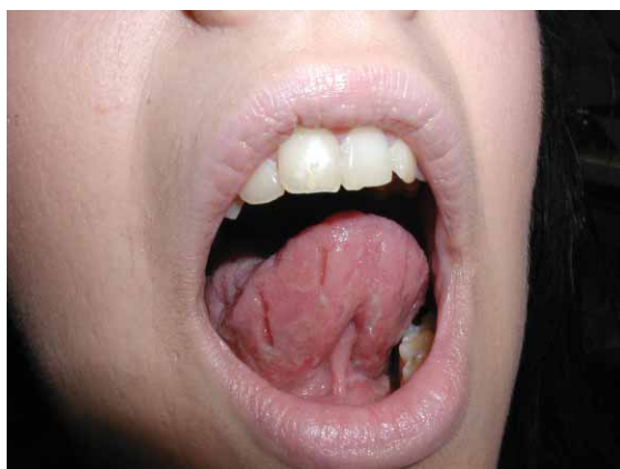
Fig. 1. Oral findings in patient with pyostomatitis vegetans and Crohn's disease – deep fissures on the ventral side of tongue.

Pyostomatitis vegetans (PV) is a rare chronic mucocutaneous disorder 1-3 . PV was first reported by Hal-