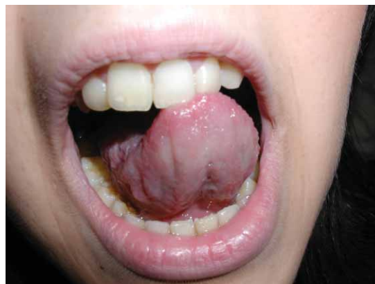
Fig. 3. Complete remission of lesions on the ventral side of tongue in patient with pyostomatitis vegetans after adalimumab therapy was started (compare with Fig. 1.).

Case 2. A 32-year-old woman with history of UC presented with yellowish, slightly elevated, pustules on the erythematous soft palatal mucosa and mucosa of the dorsal side of tongue (Figure 4) which occurred after stopping corticosteroid therapy. The patient complained of severe pain, which interfered with food ingestion. Histological examination of a biopsy specimen removed from the dorsal side of tongue showed intraepithelial and subepithelial exudates containing numerous granulocytes