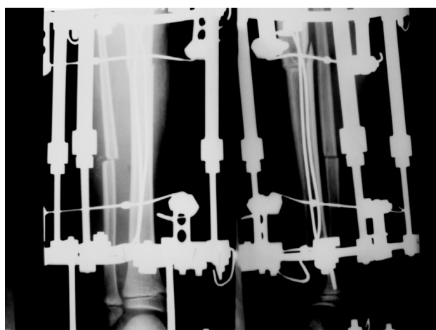
Fig. 2. The combination of Ilizarov external fixator and intramedullary alignment with two K-wires.

The following parameters were evaluated: duration of the external fixator use, healing index (HI), Inequality, Healing Index, Lengthening Index.