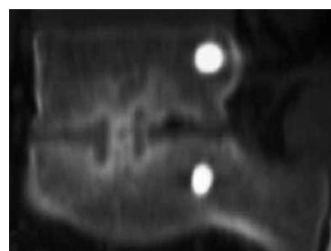
Fig 3. CT after 6 months reveals signs of fusion through CAGE.