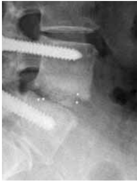
Fig 4. CT after 6 months reveals signs of pseudoarthrosis.