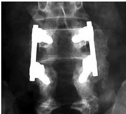
Fig 5. Bilateral transpedicular fixation and posterolateral fusion.

with deteriorating clinical presentation CT was made which showed signs of fusion in 2 cases (Figure 3), while in 2 others pseudoarthrosis was diagnosed (Figure 4), which was later settled by bilateral transpedicular fixation with larger diameter screws and posterolateral fusion (Figure 5). Signs of fusion were present in 17 (77.3%) patients. The average blood loss was 250 ml and there was no need for blood restitution, and average duration of the procedure was 135 minutes. There were no signs of lyquorrhoea or infection during or after surgery. In one patient signs of transient paresis of femoral nerve occurred which disappeared within several days.