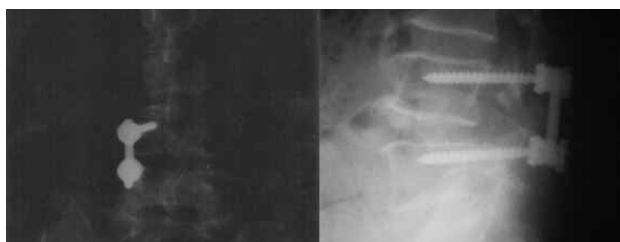
Fig 1. X-ray taken after the unilateral TLIF procedure.