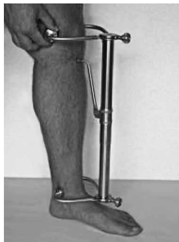
Fig. 2. Torsiometer in use.

The device is universally applicable and fully adjustable to accommodate a broad range of limb sizes, even in children. It consists of a freely rotating telescopic tube that retracts to 14 cm and arms at the end of the tube with rubberized malleolar and epicondylar (femoral) cups. A goniometric scale is precisely marked on the spot of tube rotation (Figure 1).