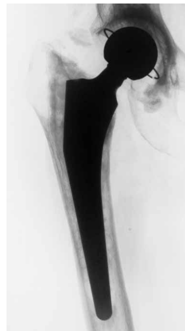
Fig. 1. X-ray of the Müller type cemented hip prosthesis with a stem occupying <90% of femoral canal diameter: A – directly after implantation; B – loosened 5 years later.

with the inner part of the femoral canal in the AP projection. In both groups this was in the lower part of the stem, which corresponds to the upper half of the Gruen zones 3 and 5. In the first group the most intimate contact was achieved with the lateral side of the femoral canal, while in the second group the distance between lateral and medial walls was equal.