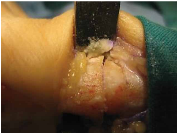
Fig. 8. Introduced bone in osteotomy gap.

joint and, by proper tensioning, the proximal phalanx is placed in the proper position. The skin is closed with ethilone No. 3 or with resorptive fibre.