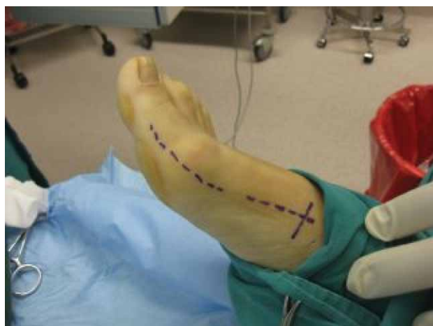
Fig. 1. A longitudinal incision is centered over the medial eminence and extended from the midportion of the proximal phalanx to a point 2 cm proximal to the medial eminence. A second incision, about 4 cm in length, is centered over the medial aspect of the first metatarsal starting from the first cuneiform-metatarsal joint.

Care is taken to identify and protect the medial dorsal cutaneous nerve. An elliptical capsular incision is performed to expose the eminence. The incision is extended in proximal and distal directions of the remaining capsule for a better exposition of the bones (Figure 2).