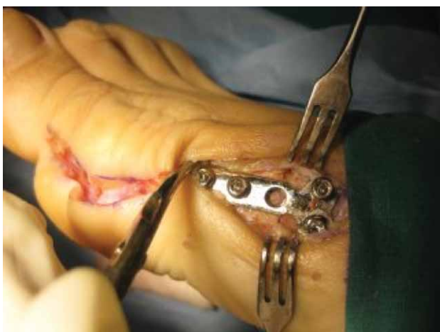
Fig. 9. Osteotomy is stabilised with T or L shape plate with 5 holes.

Passive and active range of motion exercises are commenced ten days following the surgery. The length in