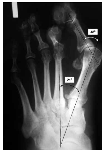
Fig. 10. Preoperatively plain radiograp in full weight bearing position showed intermetatarsal angle of 21° and Hallux Valgus angle of 48°. The subluxation with arthritic changes in metatarsophalangeal joint are also noted.

A 68-year-old woman presented with symptomatic Hallux Valgus deformity of her right foot. She had a pronounced »bump« on the medial side of the metatarsal head with skin redness over it. She suffered great pain in the forefoot and had a pronounced shoe wear problem. Callosities over the plantar side of the metatarsal head were also present.