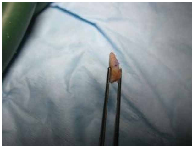
Fig. 7. Bone removed from pseudoexostosis modulated in a triangular shape.