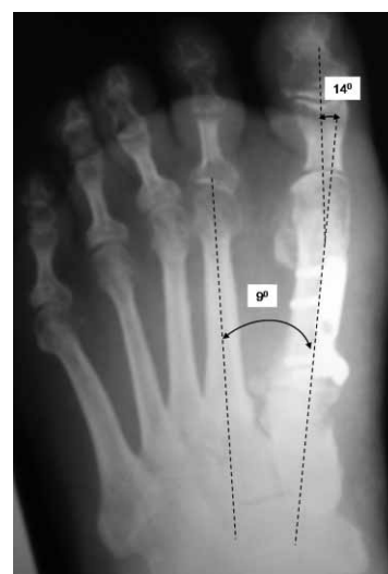
Fig. 11. Plain radiography in full weight bearing position eight weeks after operation, show intermetatarsal angle of 9° and Hallux Valgus angle of 14° with bony union.