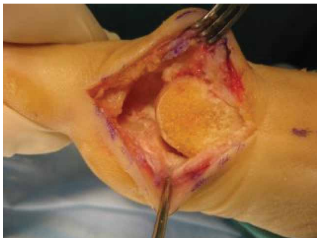
Fig. 4. Medial part of the metatarsal head after resection of pseudoexostosis.