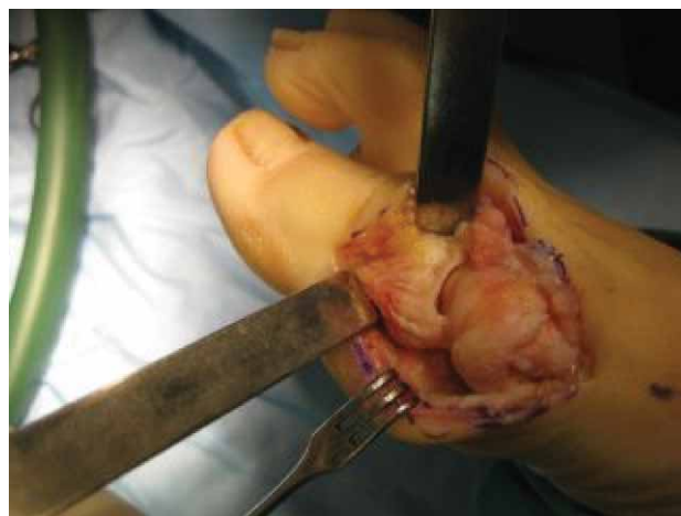
Fig. 3. Exposed metatarsophalangeal joint.

in line with the medial cortex of the first metatarsal shaft. Excessive resection should be avoided as it may lead to Hallux Varus deformity. Sharp edges are removed with a rongeur (Figure 4).