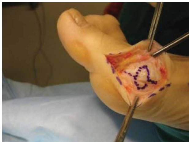
Fig. 2. Elliptical shaped capsular incision over metatarsophalangeal joint with proximal and distal extension.

The base of the proximal phalanx is freed of the soft tissue with a knife and a rasp and mobilised (Figure 3). Care is taken not to damage the flexor tendon of the Hallux . The base of the proximal phalanx is resected by saw, mostly removing about one-third of the phalanx only.